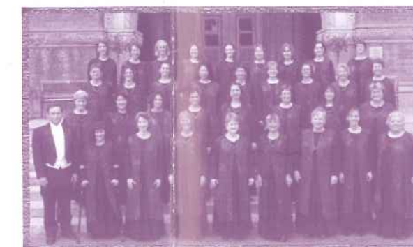
Peninsula Women's Chorus "Song of Survival" Women's History Month Opening Ceremony